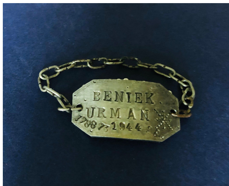
This bracelet was buried for 45 years before being found under several inches of brush and dirt during an archeological dig.